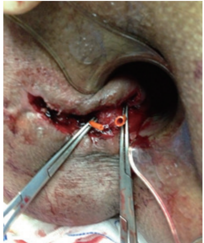
Fig. 1. Placement of loose seton in the transsphincteric fistula tract.

Three months after the seton placement, the patient was readmitted to the hospital for the second stage of the procedure. During the second stage, the previously placed seton was removed, and in order to close the internal and the external orifices of the fistula tract, respectively, a mucosal advancement flap procedure