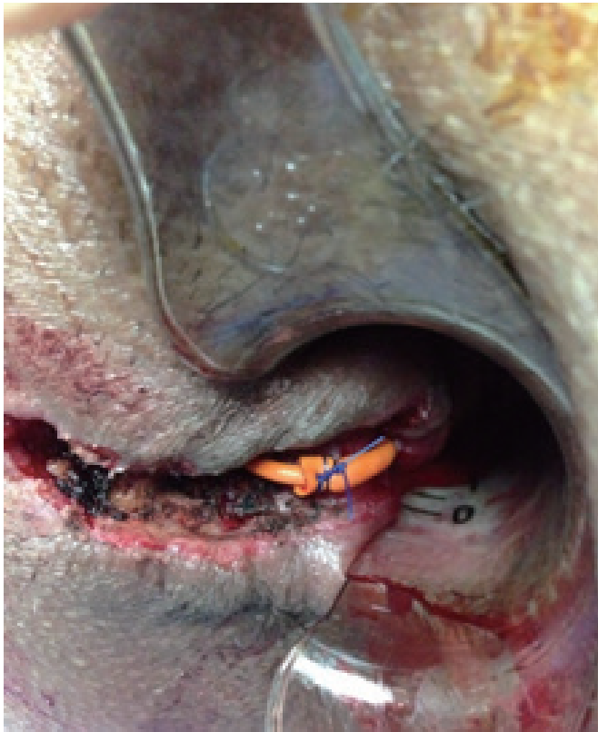
Fig. 2. Appearance of the loose seton after its two ends had been tied to each other.