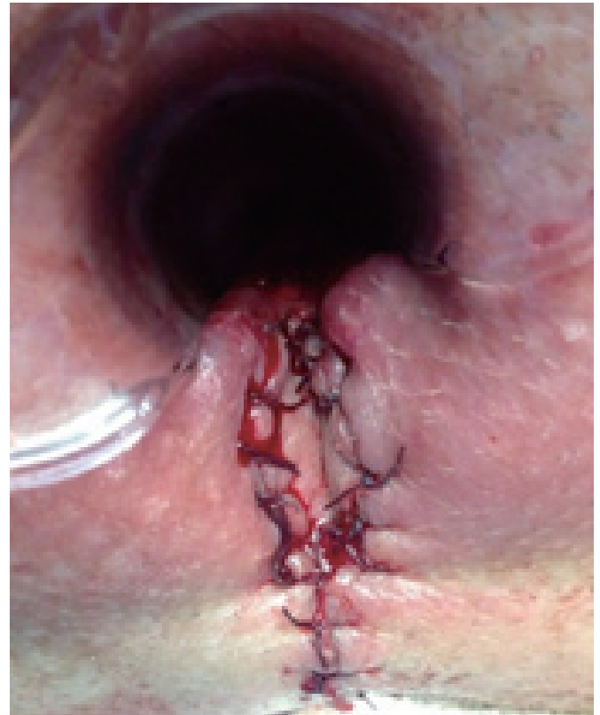
Fig. 4. Postoperative examination of the anal canal.